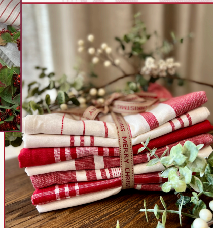
Bundle for Mini Christmas Stockings

All the customers need to add is 1 1/3 yd plain white for lining and cord to hang them up.