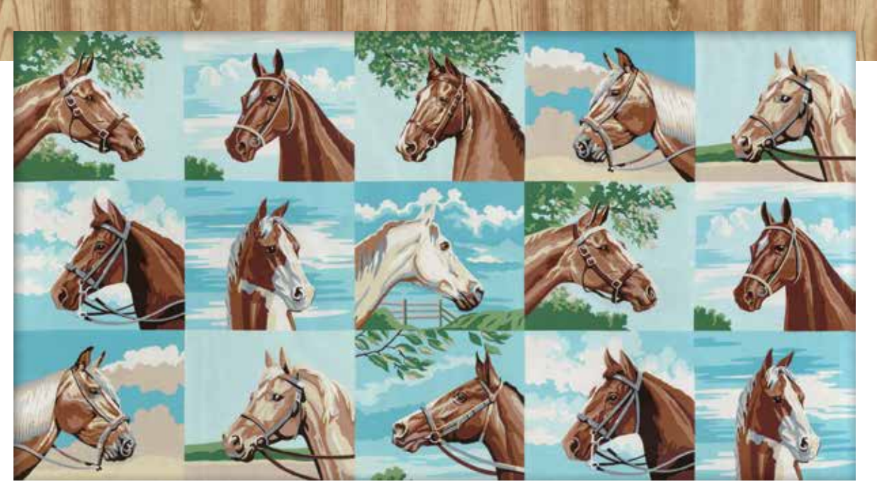
26120 11 Panel measures 24" x 44" Each block measures approx. 7.5" x 8.5"