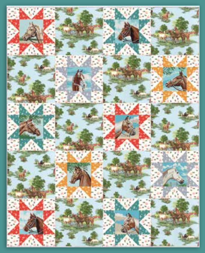
PS26120 Purebred II Size: 56" x 70"