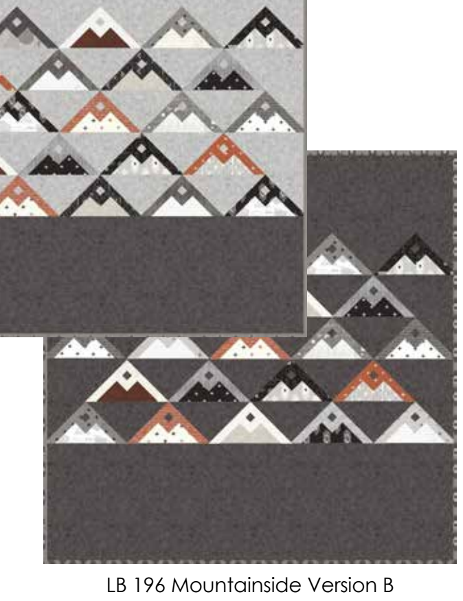
68" x 72" F8 Friendly