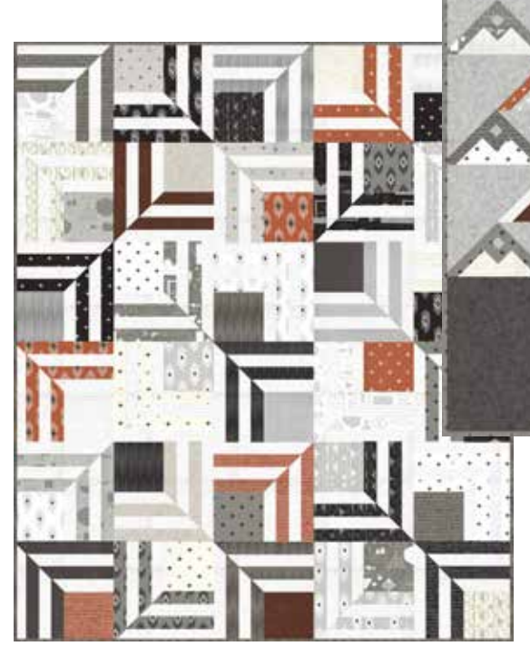
LB 195 Fracture 60" x 72" F8 Friendly