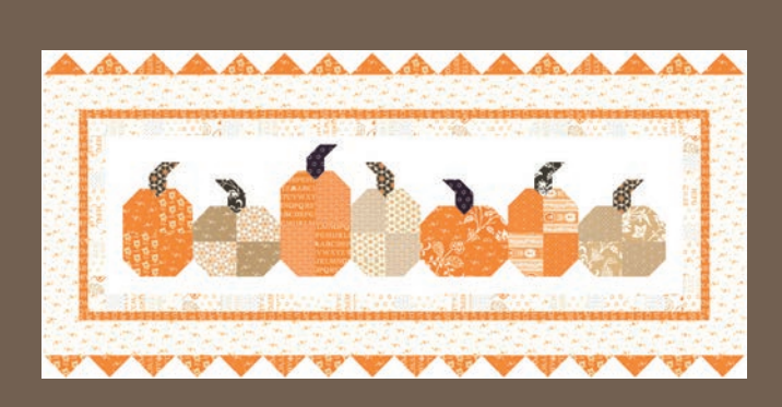
FT 1675 Pumpkins in a Row 16" x 40" PP Friendly