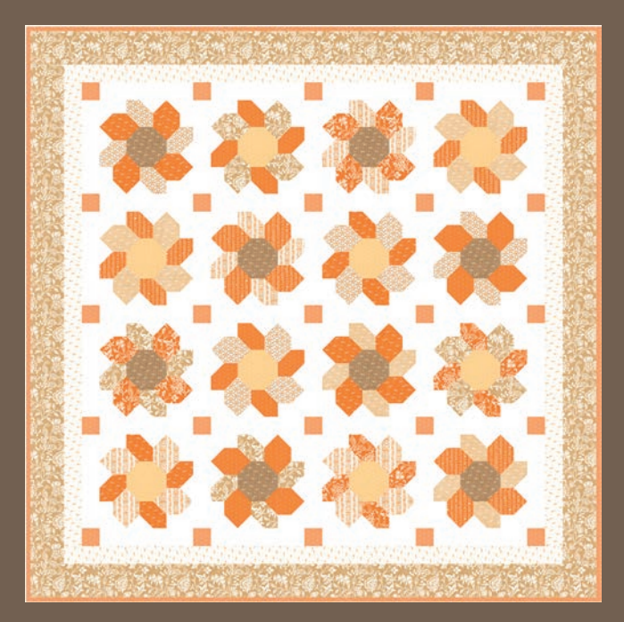
FT 1654 Sunflowers 64" x 64"