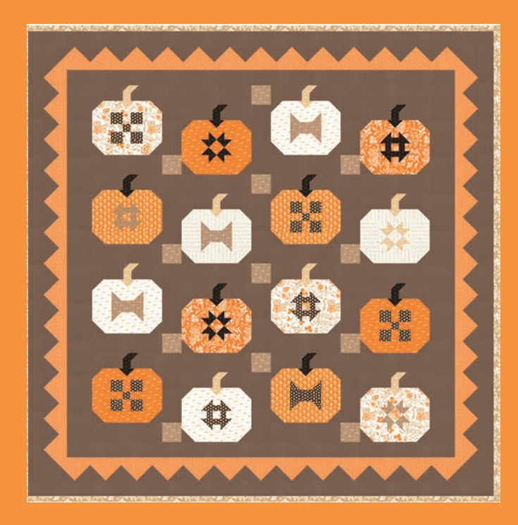
FT 1465 Pumpkins & Cream 60" x 60"