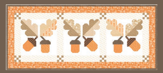
FT 2050 Agatha's Oaks Runner 69" x 29"

FT 2050 Agatha's Oaks Wall Hanging 25" x 25"