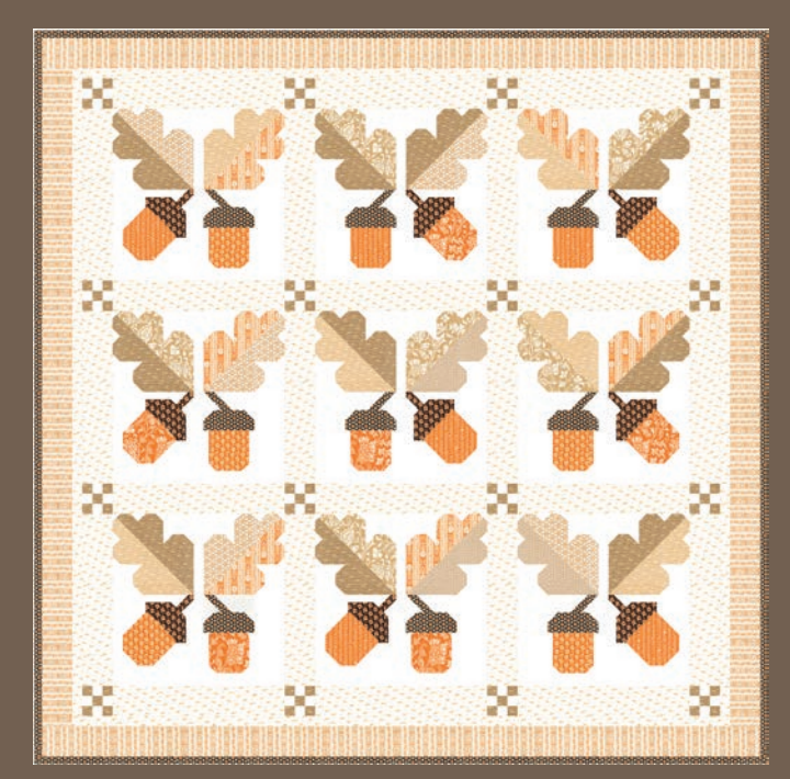
FT 2050 Agatha's Oaks 71" x 71"