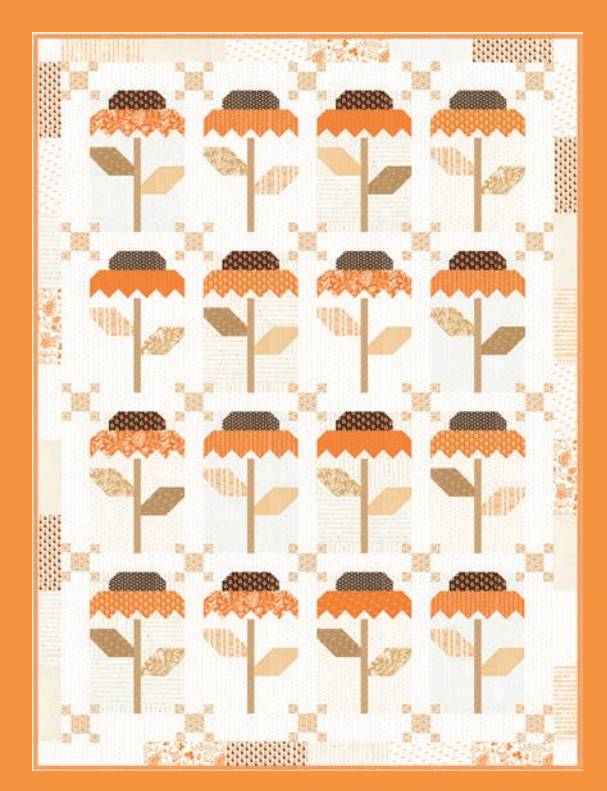
FT 2002 Black Eyed Susan 57" x 77"