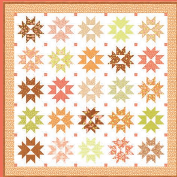
FT 1855 Harvest Stars 57" x 57" LC Friendly