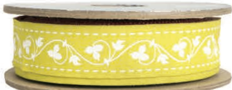
2117 15 Green