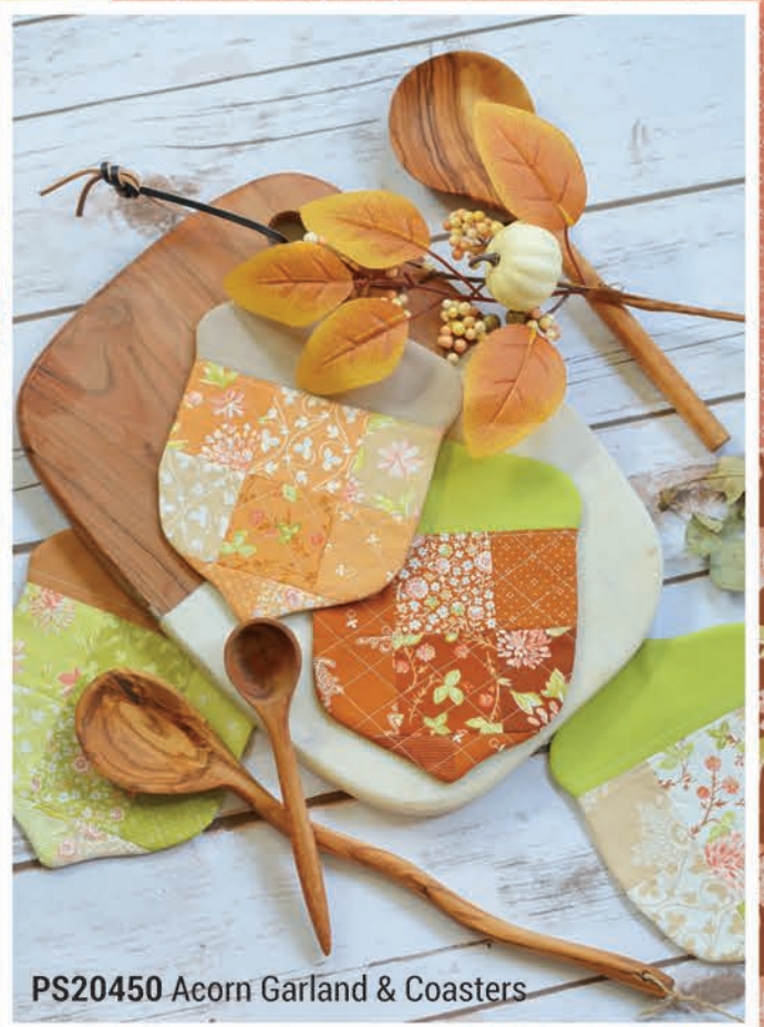
PS20450 Acorn Garland & Coasters

This collection filled with the rich tones of autumn... cinnamon, caramel, and butterscotch, accented with mouth-watering corals and pinks. It's the perfect palette for so many autumnal and classic quilts and projects!