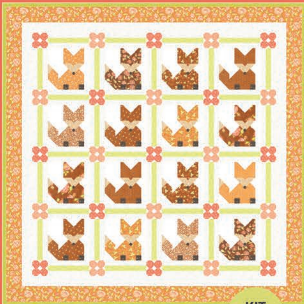
FT 1851 Francesca 57" x 57"