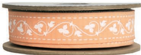
2117 16 Peach