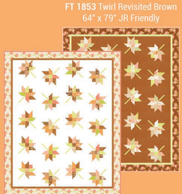
FT 1853 Twirl Revisited Brown 64" x 79" JR Friendly