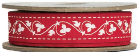
2117 14 Red