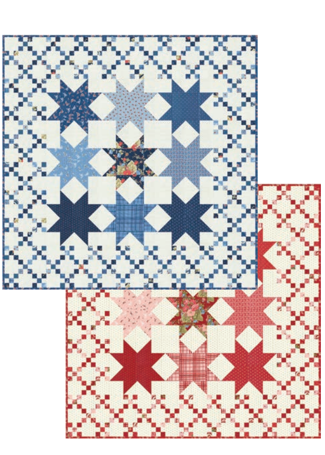
MS 1201 Ellen's Sewing Basket | 88" x 88"