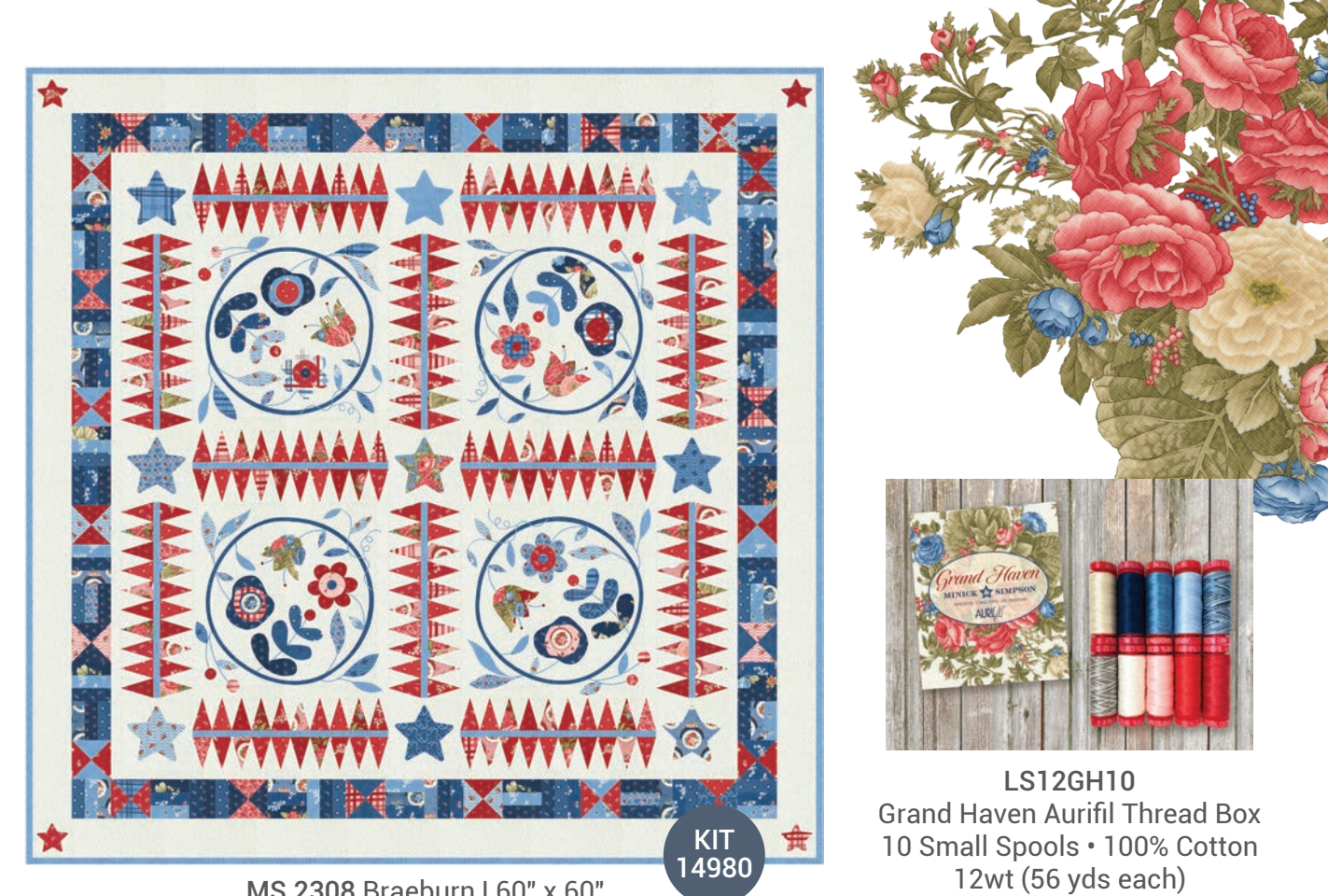
MS 2308 Braeburn | 60" x 60"