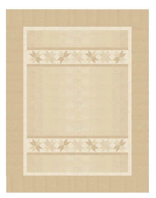
KT 24120 Comfy Stars Twin 82" x 106" DR Friendly