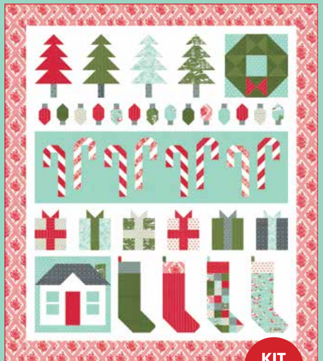
TB 255 Christmas Stroll 74" x 84" FQ Friendly