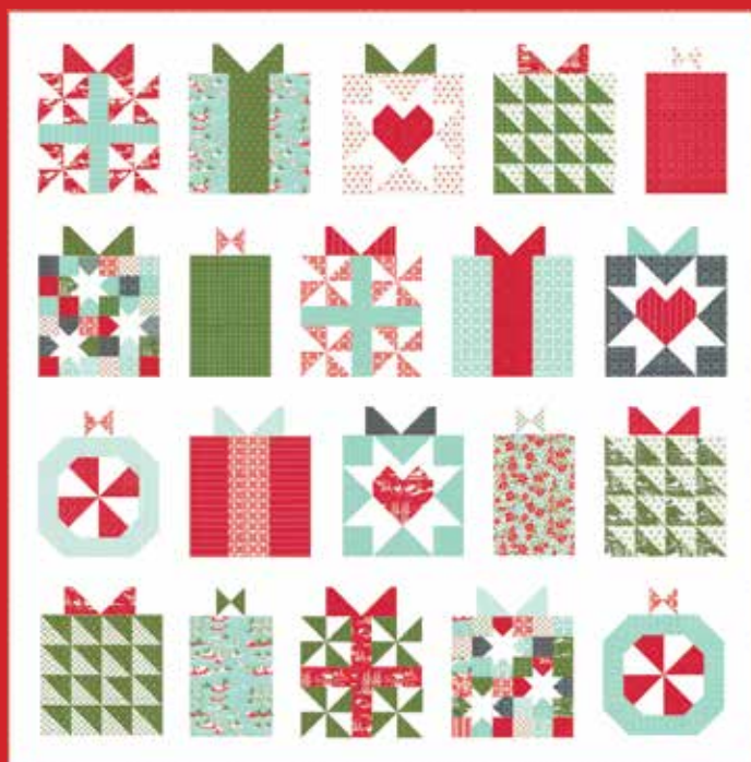
TB 210 Handmade With Love 74" x 75"