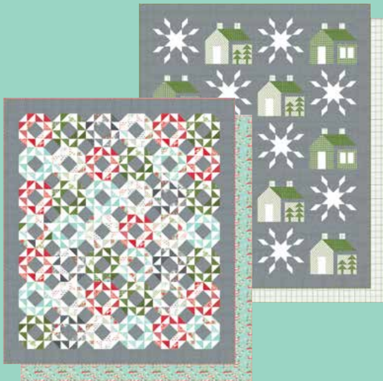
TB 258 Joyful 68" x 79" LC Friendly Backing - 55240 16