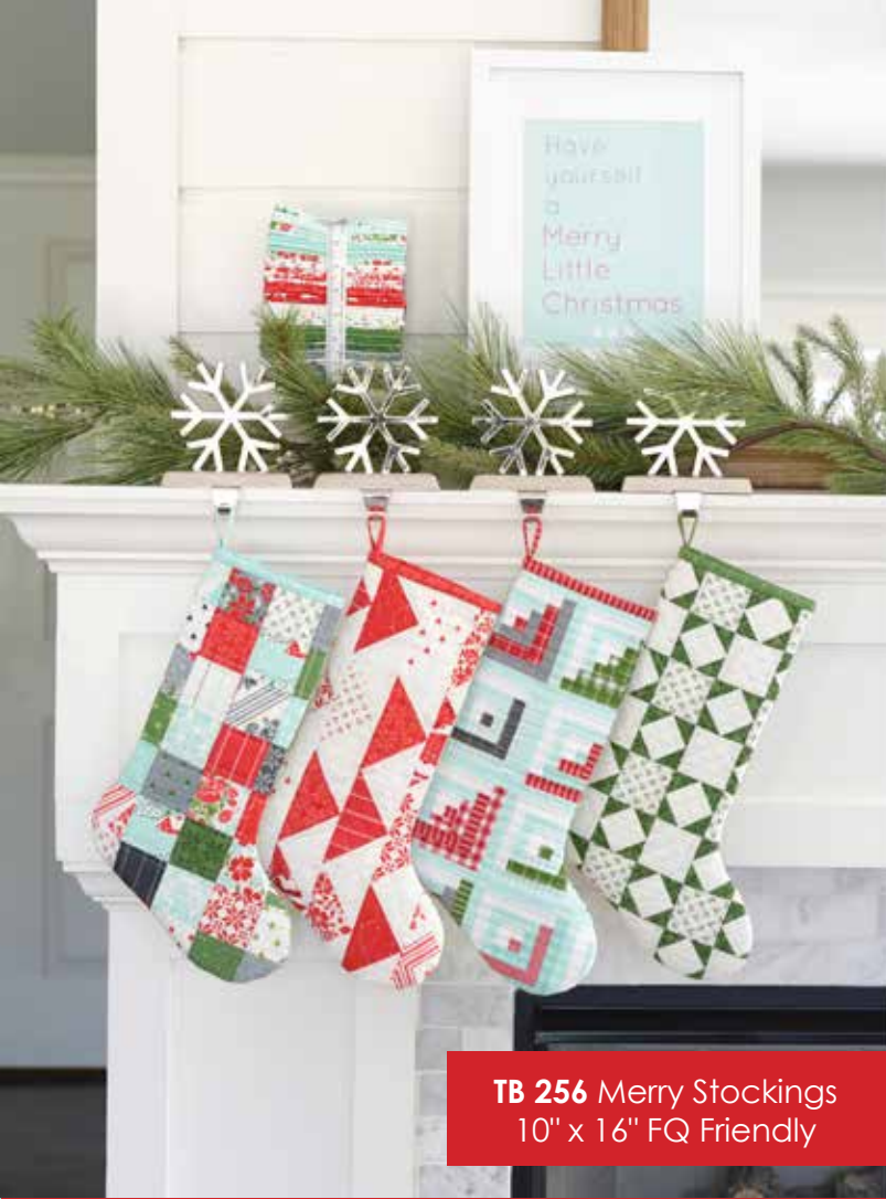
TB 256 Merry Stockings 10" x 16" FQ Friendly