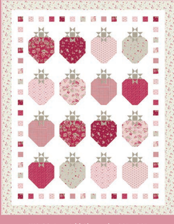
WS 11 Just Add Shortcake 66" x 82"