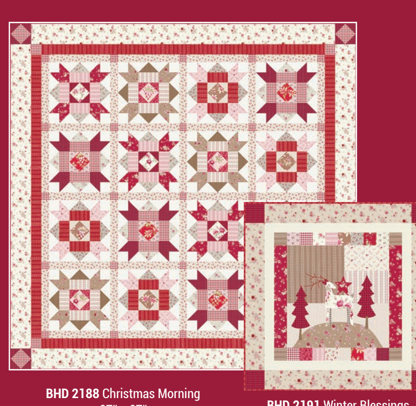
67" x 67"