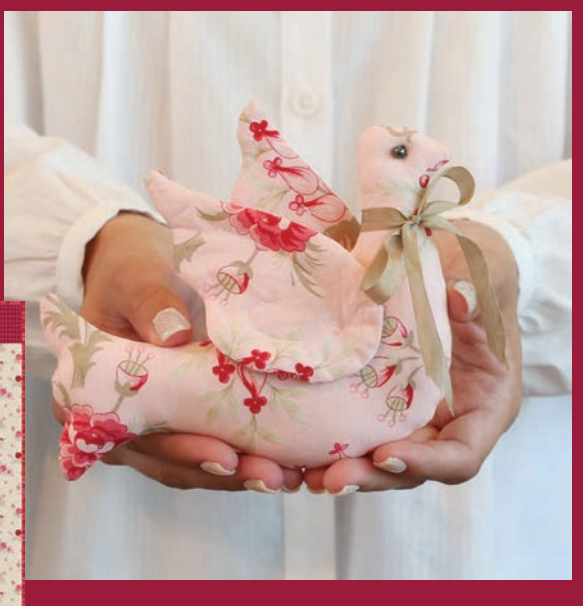
BHD 2190 Crystal, A Bunny Hill Petite 4" x 6"