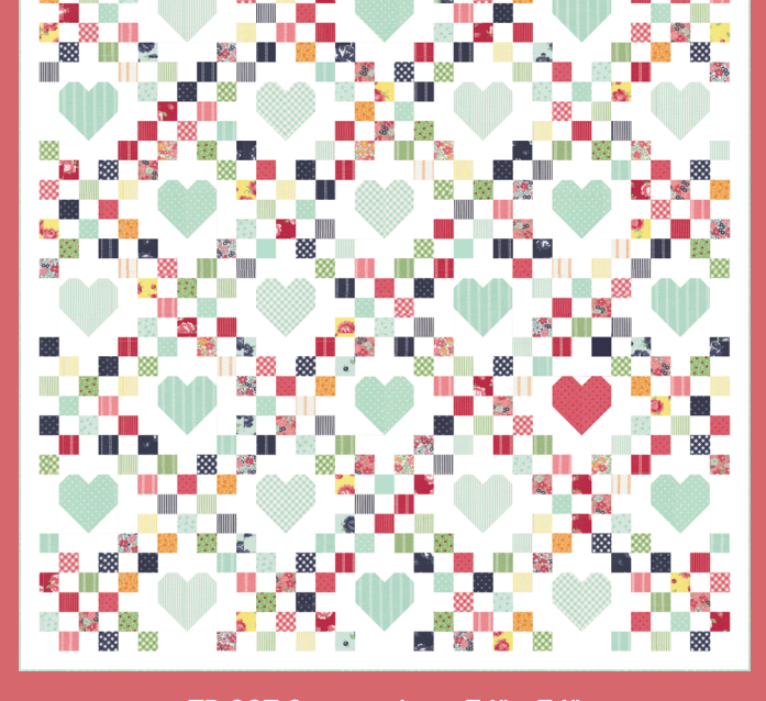
TB 289 Under the Stars 68" x 72"