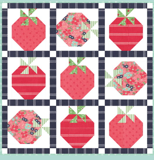
TB 288 Berry Picking Mini 18" x 18"