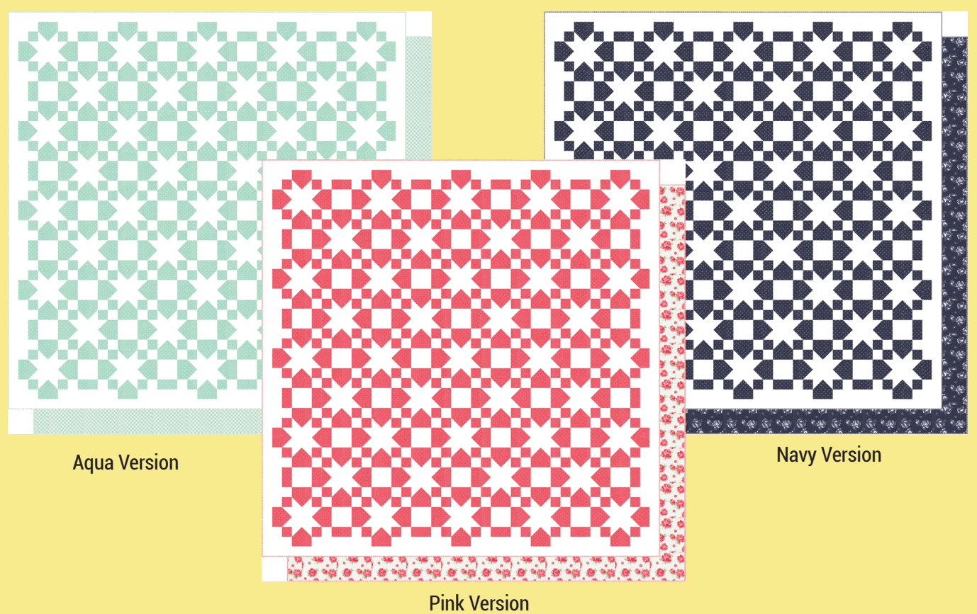
Pink Version TB 261 Lighthouse 80" x 80"