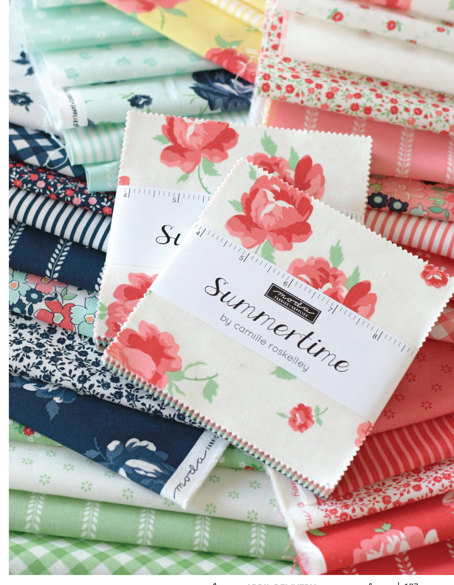
moda APRIL DELIVERY moda | 127