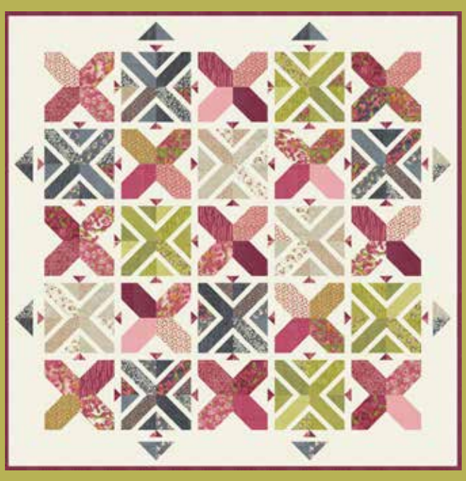
RPQP CCK140 Cross Stitch Kisses Queen 96" x 96"