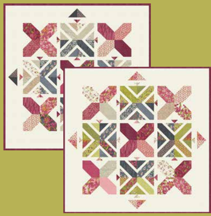
RPQP CCK140 Cross Stitch Kisses Lap 63" x 63" LC Friendly