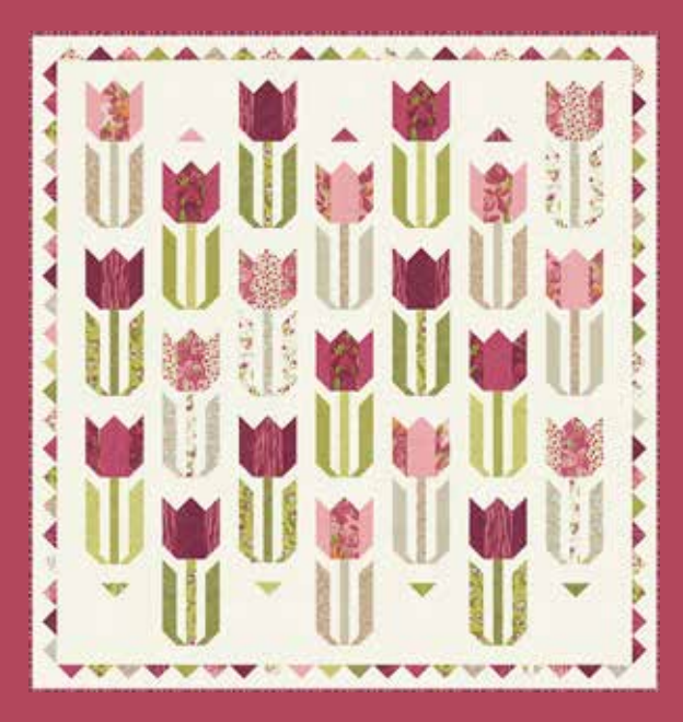
RPQP T5139 Tulip Season Lap 65" x 68" Additional size available