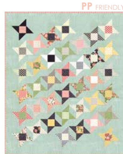
11176 from the book Charm School: Rock Star Size: 69" x 81"