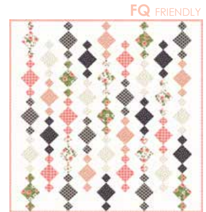
11176 from the book Charm School: Chandelier Size: 60" x 60"