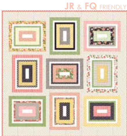
LB 160 / LB 160G Kith & Kin Size: 73" x 73"