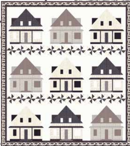
Pattern by Coach House Designs CHD 1712 / CHD 1712G Community Size: 80" x 89"