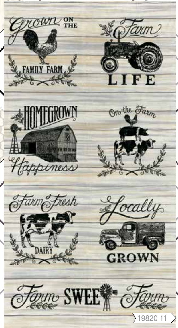
Reduced to show full 24" x 44" repeat.

See more patterns by Coach House Designs on Extra Quilts Page