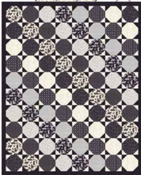
Pattern by Coach House Designs CHD 1710 / CHD 1710G It's Black and White Size: 50" x 62"

See more patterns by Coach House Designs on Extra Quilts Page