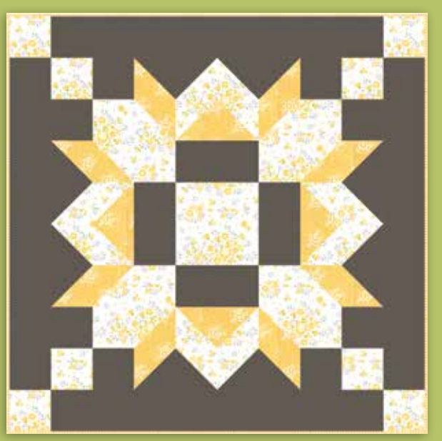
CQ 127 / CQ 127G Barn Star Size: 40" x 40"

Ask about SUNNY STITCHES Aurifil Thread Kit #CY12SS10, small collection 12 wt