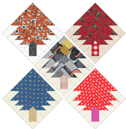
Collections shown: Midnight Magic 2, Home Sweet Holidays, Celestial, Sincerely Yours, & Newport