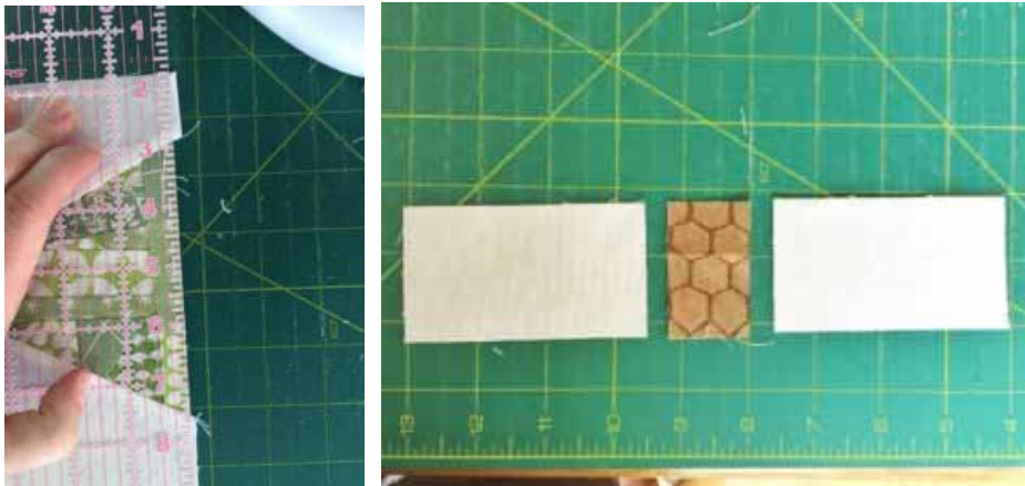
To make your trunk, you'll need 2- 2" x 3.5" pieces of background and 1- 1.25" x 2" trunk piece. Sew them together. Press the seams towards the trunk. Sew the trunk piece to the tree piece. Press.