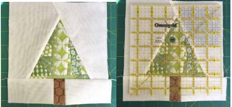
Trim your block to 6.5" x 6.5". I used a 6.5" square to do this.

When I trimmed mine, I made sure my the top line of my trunk was at 5.25" and the tree center was at 3.25". That way when I made a bunch of these to put together, all of my trees would line up nicely.