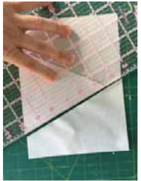
Make a cut on the right side of the tree using your ruler and rotary cutter.