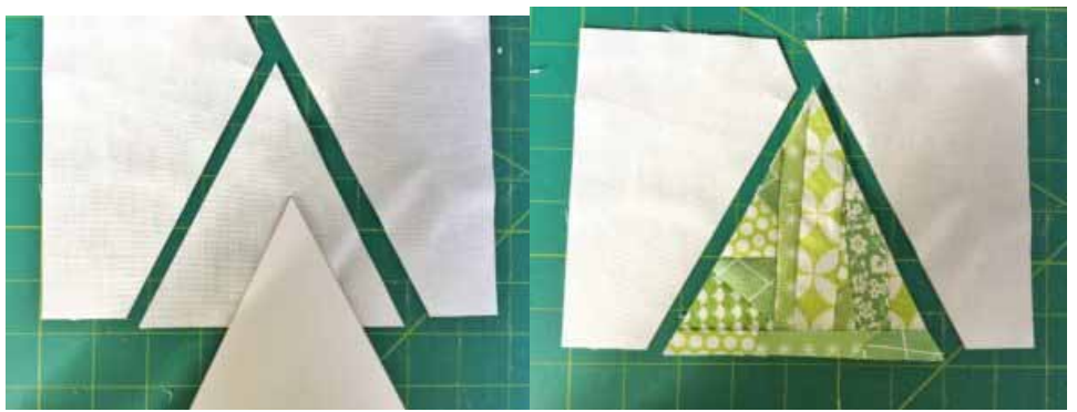
Swap the white tree for your the tree you made above.

Sew the tree to the left side of the background. Press and then trim off the little bit of background.