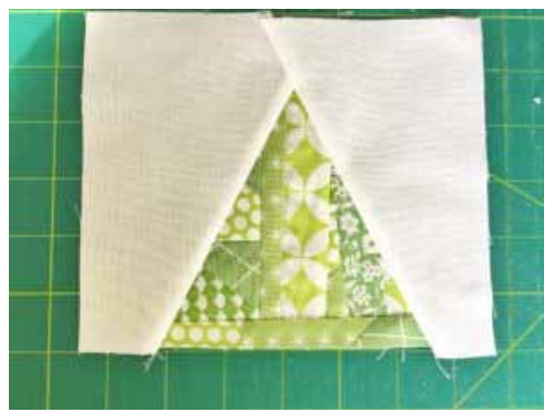
Press and trim off the extra background at the bottom.