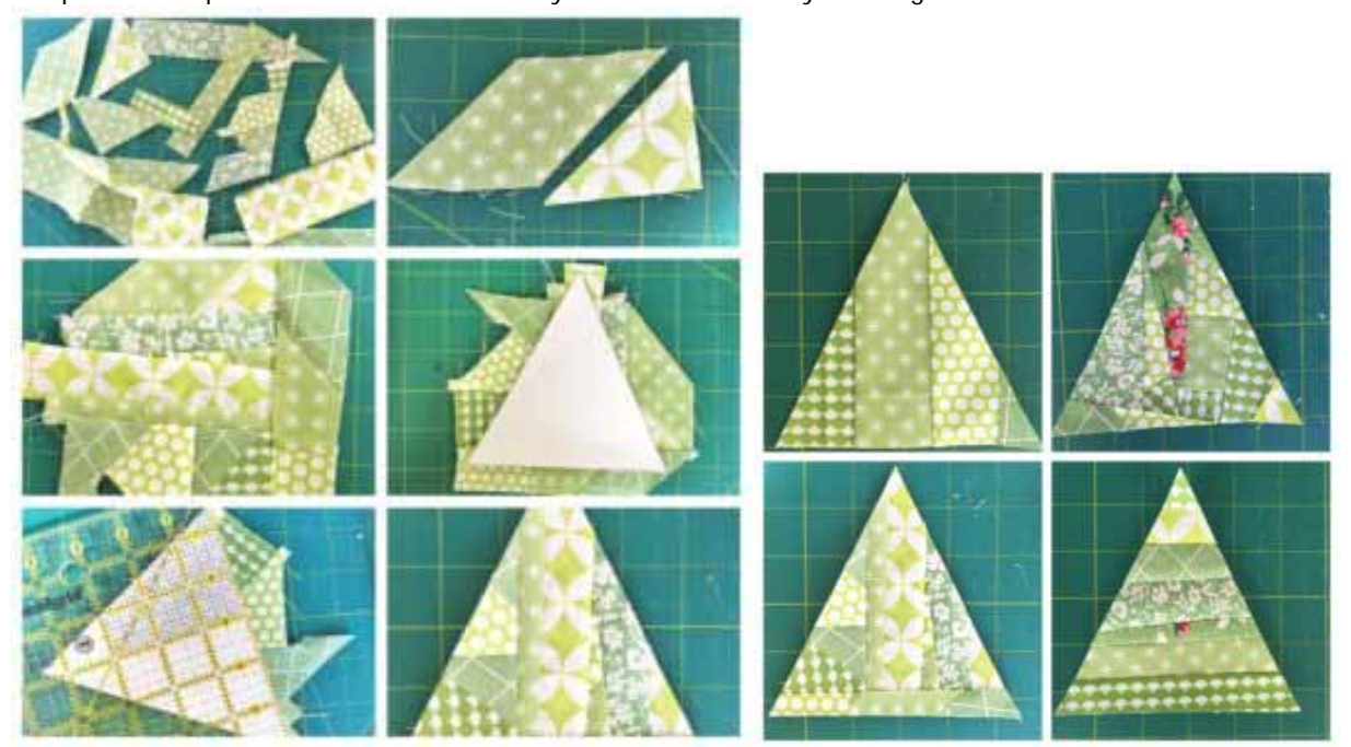
And you are left with a perfect tree! Here are some of the other ones that I made.

Use a solid fabric that's about 5" square or a scraps assembled together to be about that same size. Lay the tree template on top. Use the ruler and rotary cutter to cut away the edges.