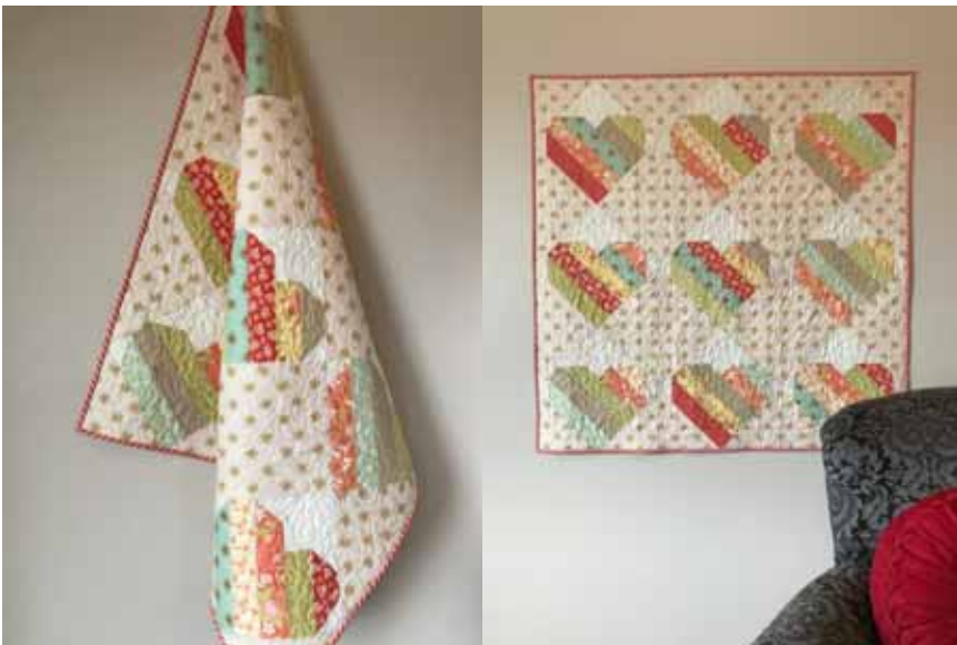
Quilted by Utah Valley Quilting .