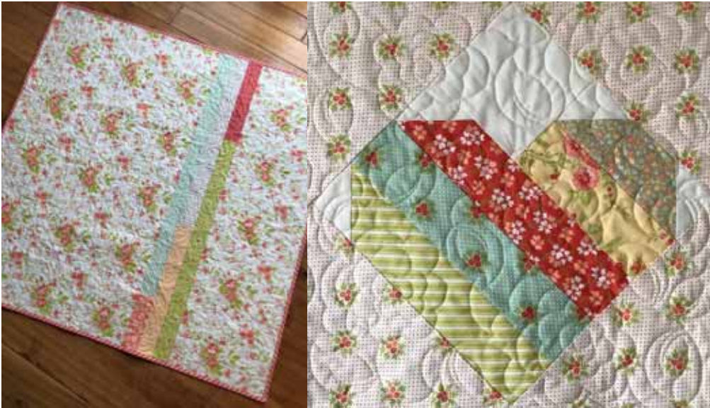
Quilt as desired and bind.