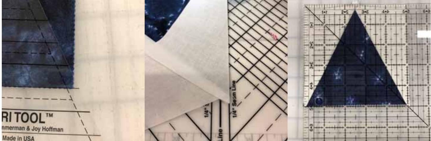
Assembling the top:

You will end up with a slightly cut off corner; that's okay and just keep the ruler as centered as possible on the bottom edge of the charm square.