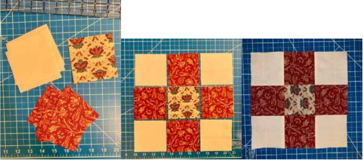
Arrange in three rows of three.

Sew the squares together to make up the rows. Press the seams towards the darker squares. Sew the rows together to form a nine-patch.