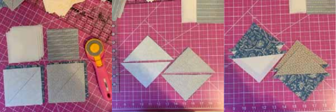
Stitch 1/4 inch on each side of the line.

Draw a diagonal line on the back of your background fabric.