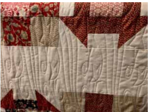
Quilt with your favorite backing and batting and bind using your favorite method.