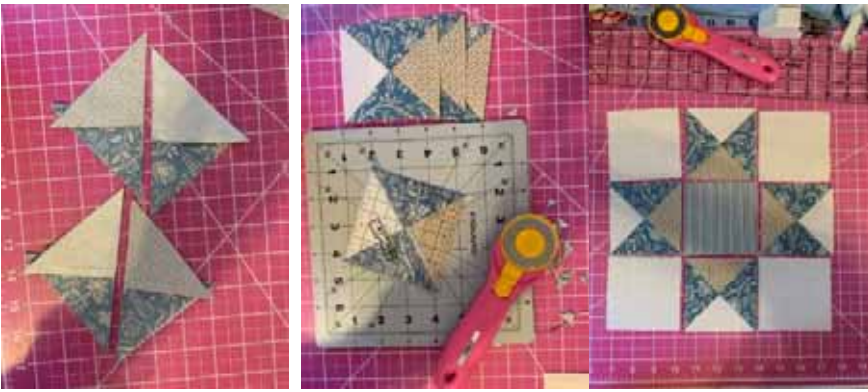
Press your two squares open